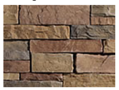
Limerock Vintage Buff