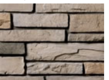
Ledgerock Stone Brown

* See actual warranty for details, limitations and exclusions.